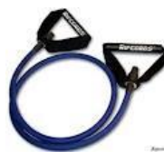
Band with handles