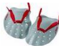
Aqua fit paddles

Water exercise, or aqua fit, as it is sometimes called, is usually offered in community centres or athletic centres which have swimming pools. The resistance is provided by moving one's hands or legs against the water. Paddles provide a larger surface area than the hands, and are often used to increase the resistance in the water. The larger the surface area of the paddles, the greater the resistance and the more difficult or intense the exercise.