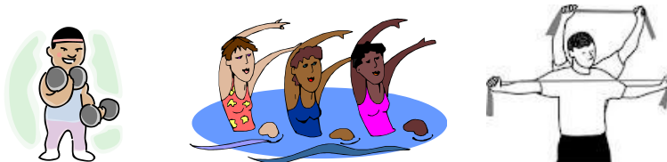
Understanding Strength Training Exercise

The largest living animal on earth, the blue whale, has a massive skeleton that weighs three tonnes.