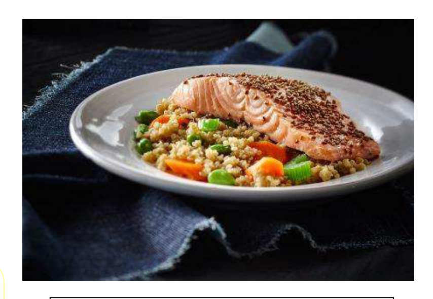
For more information about this recipe: https://www.dairygoodness.ca/getenough/recipes/sesame-ginger-veggie-quinoa-with-salmon

In this recipe, the accent flavours of sesame, ginger and soy sauce soak right into the quinoa and vegetables. The salmon is cooking on the top of this mixture to give you a complete meal all in one pan, ready in just half an hour. This is sure to become a new weeknight go-to meal.